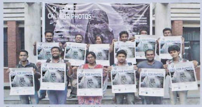
Poster distribution of call for photos

East West University Photography Club in going to organize 9th annual photography exhibition at Dhaka Art Center on 27th to 29th December, 2014. Deadline of call for photos was 30th November. EWUPC completed their judging for annual exhibition on 4th December. The judges were Ismail Ferdous (Documentary Photographer) and M A Ahad (Photojournalist at Associated Press (AP).