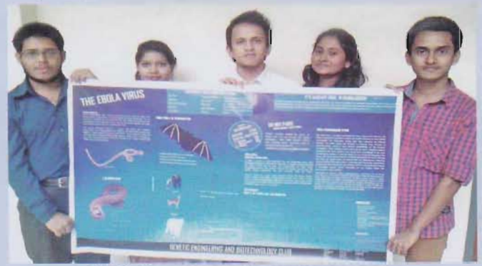
EWUGEBC members with the Ebola virus poster

Also, in recognition of the current Ebola outbreak in West Africa, (first cases notified in March 2014), the GEB club designed and posted a poster on campus providing information on the Ebola virus background, transmission, diagnosis, treatment, prevention and control.