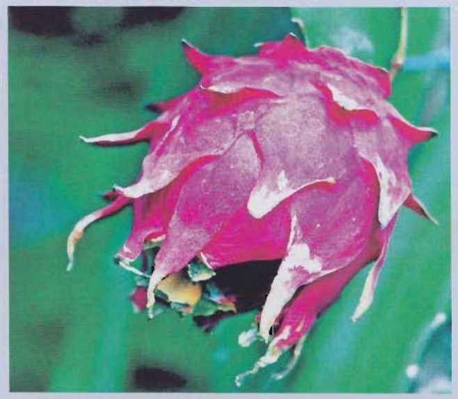
A Dragon Fruit Variety Being Developed at the BAU Germplasm Center