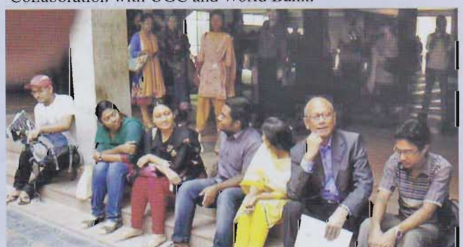
Education Minister Discussing with students at EWU corridor

The government of Bangladesh wants to maximize the opportunity of exploration of marine resources after the settlement of a maritime boundary with India and Myanmar. Education Minister Nurul Islam Nahid stressed the need to develop skilled human resources for exploration of oil, gas and marine resources of the country in the exclusive economic zone of Bangladesh. The Minister said these at a seminar on 'Exclusive Economic Zone: Impact on Bangladesh Economy' arranged by East West University, on 18 November, 2014. The seminar was organized by East West University in Collaboration with UGC and World Bank.