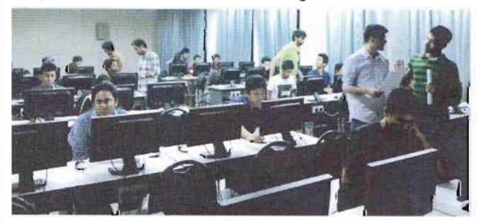
Trainer Along with EWUBC participants

EWUBC comes up with a routine schedule of sessions and workshops every semester. In Spring 2015 the club successfully coordinated a workshop on Advance MS Excel that has enlightened the students sustained the growth of the club.