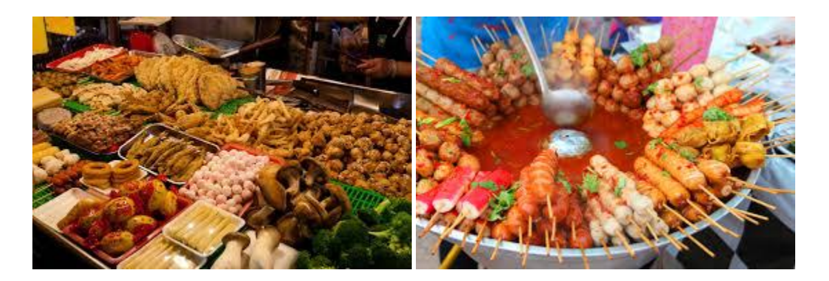
Fig 1.1: Street-vended food

Street food is exactly means the food available in a public place, such as from a vendor on a street. Typically, street food is tasty, ready-to-eat food or drink sold on the street, in a market, fair, park or other public place. It is sold by a hawker or vendor from a portable stall, cart or food truck (Streetfoodinstitute.org, 2013).With variations within regions and cultures street food vending is found across the world. Sold by vendors and peddlers street food is the ready to eat food or drink sold on street and public spaces (Nasvinet.org, 2017).Vendors usually use portable booth, food cart or truck to sale the food items. The chief characteristics of street food is that street foods are reasonably priced and flavored and easily available. Street food started in Asia, is massive in America, and now Europe's getting a taste of the action too (Street Food UK, 2014).