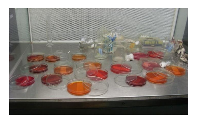
Figure 3.1: Petri dishes preparation

The different types of prepared Agar solution were poured into each of the three Petri dishes in a way so that each Petri dish gets 12-15 ml agar medium. Agar medium was dispensed into each Petri dish to get 3-4 mm depth of agar media in each Petri dish. After pouring the agar medium, all Petri dishes were kept in room temperature so that agar medium can become properly solidified. Then sodium chloride were inoculated in the Petri dishes with the help of cotton buds and loops.