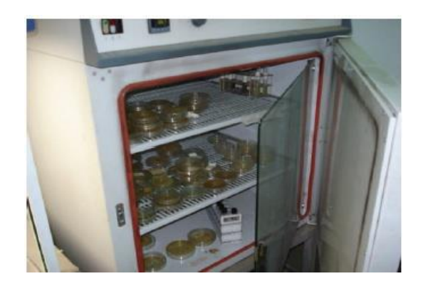
Figure 3.2: Incubator

Standard Colony Morphology of Suspected Organism in Different Media After overnight incubation of the specific media, organisms were selected based on the following criteria: