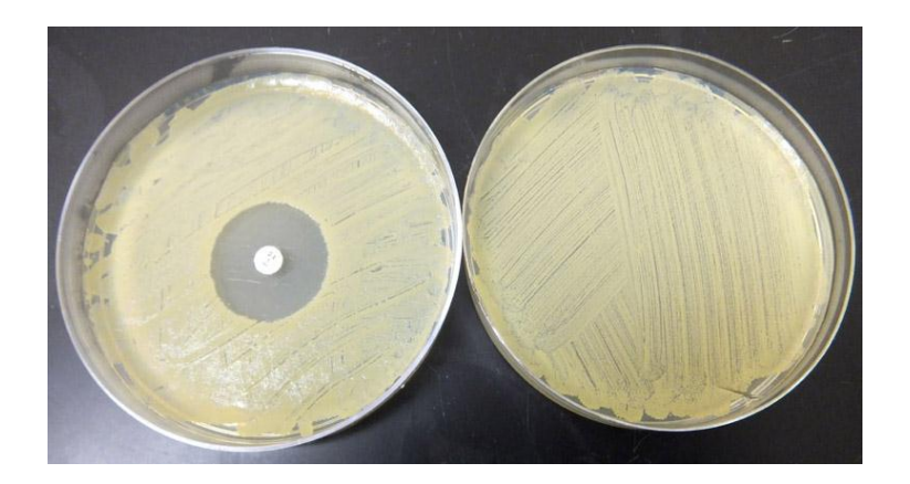
Figure1.2: Left Plate is of S. aureus with Oxacillin disk, Right Image is lawn growth of S. aureus.