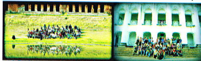
4th Basic Photography Workshop Field Trip at Baliati, Manikgong

Over hundred students applied for this workshop, but only a selected group of 60 people got the chance to participate in the event.