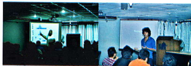
Instructors from Pathshala giving lecture in Workshop

The East West University Photography Club (EWUPC) kicked off their activities in 2012 through the fourth Basic Photography Exhibition 2012.