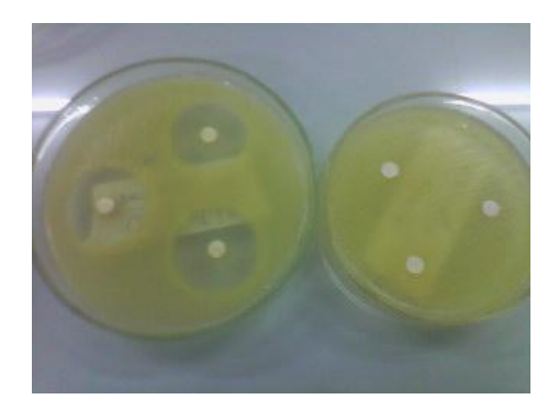
Figure 2.1: Zone of Inhibition

The agar plates were then incubated in the incubator and a temperature range of 35^{\circ}c \pm 2^{\circ}c was maintained. Results were recorded in a record book after 18-24 hours of incubation. The zone sizes were measured to the nearest millimeter using a ruler or calipter. The diameter of the disc was included in the measurement. When measuring zone diameter, it was round up to the next millimeter (Felmingham and Brown, 2001). Triplet test was done for each concentration of the each sample, and the average diameter was taken for recording the zone of inhibition.