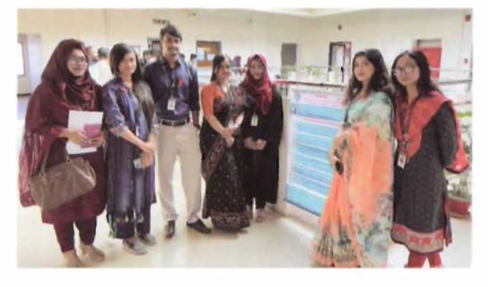
Department of Social Relations celebrated World AIDS Day 2022

Department of Social Relations celebrated World ALDS Day 2022