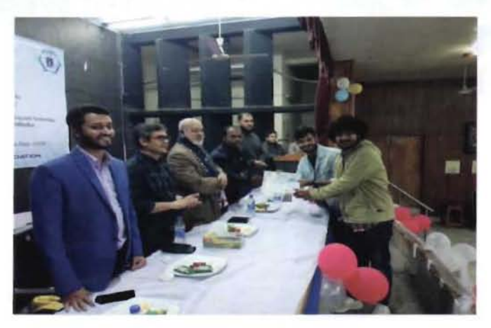
EEE Day 2022 Day

The competition was segmented into 8 portions and there "was tremendous competition among the teams from private and public universities in Bangladesh. Team O-Zone won the competition on the project showcasing portion and became the Champion in that segment.