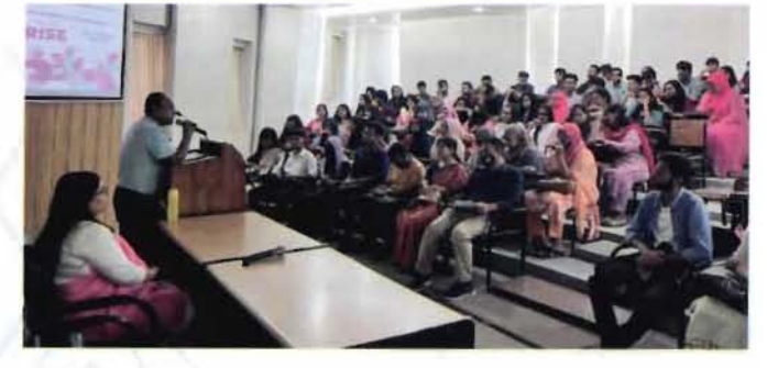
Department of Social Relation organized Seminar to observe "Breast Cancer Awareness Month. October 2022"

Department of Social Relations organized seminar to observe "Breast Cancer Awareness Month, October 2022"