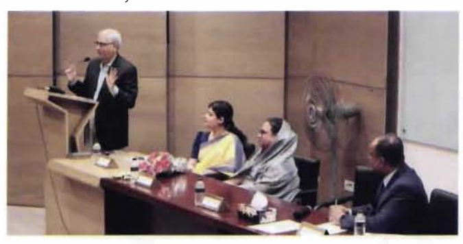
Department of Social Relations organizes seminar celebrating World Mental Health Day 2022

The Department of Social Relations held a seminar on October 24, 2022, to celebrate World Mental Health Day with the theme "Make Mental Health and Wellbeing for All a Global Priority."