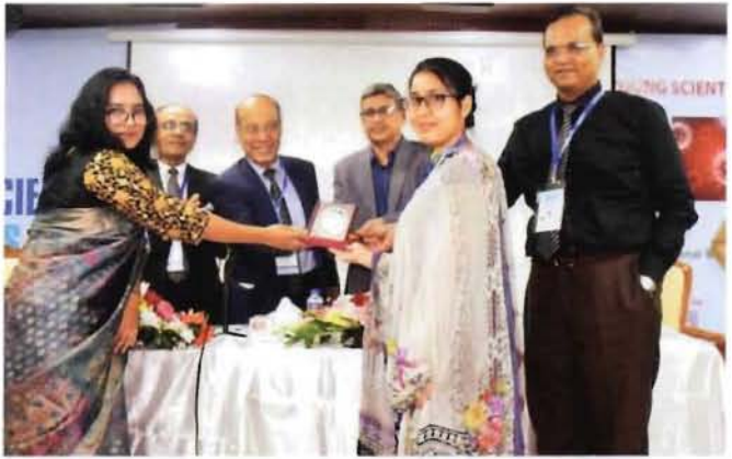
Best Poster Award Reception

of hypoglycemic and antihyperlipidemic effects of crude methanol extract and its ethyl acetate fraction of Terminalia bellirica fruits in fructose-induced Type 2 diabetes Mice" was conducted as part of the M.Pharm students.