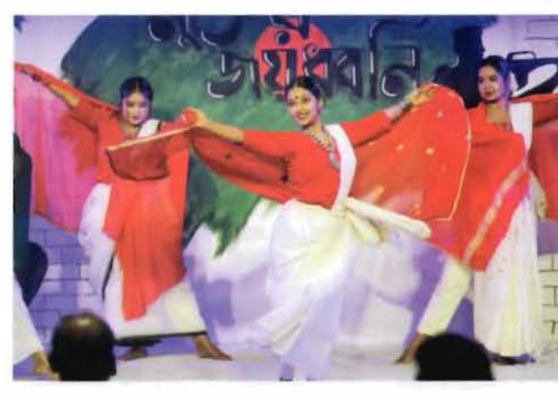
Seminar on "Music and Fine Arts"

East West University Club for Performing Arts orgar a program on December 16, 2022 named "মুক্তির জয়খনি". program started with the National Anthem and remember the sacrifice of freedom fighters during the Liberation Then the audience had the opportunity to hear a few w from the Treasurer (EWU) and the Moderator of the cl