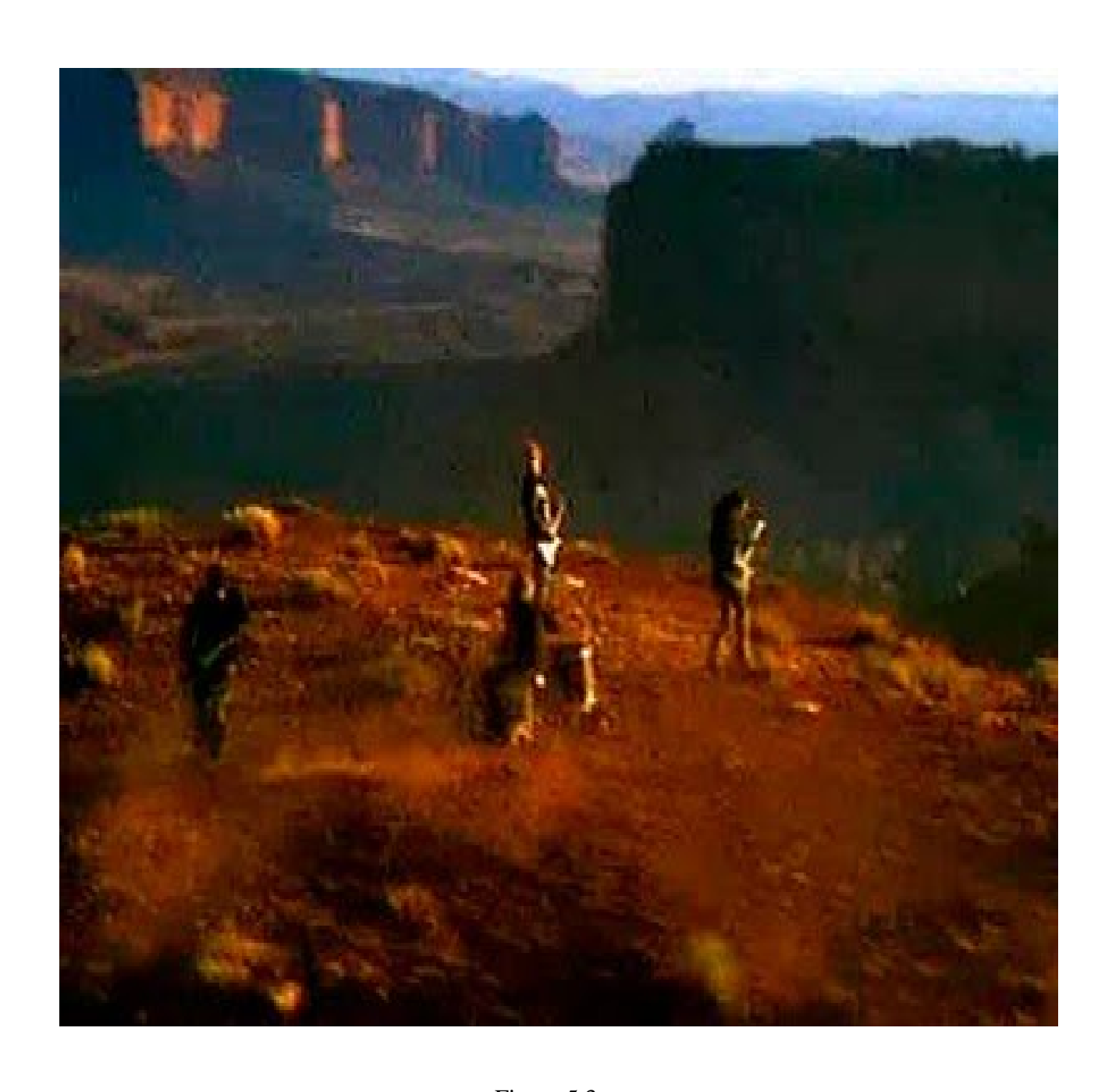
Figure 5.3 (Music video of 'Metallica', track- 'I disappear')