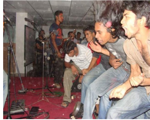
Figure 5.1 figure 5.2

(Bassist, Jason, of Metallica banging (A wild crowd banging heads in the concert)