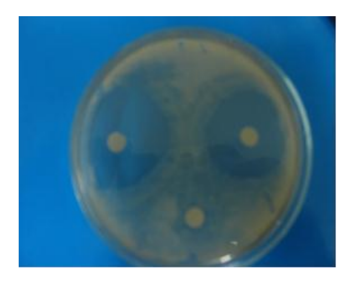
Fig.2.1 Zone of inhibition of sample and standard

4. Results were read after 24 hours of incubation.