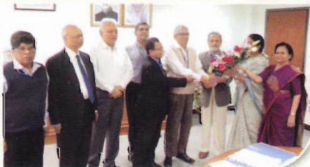
BOT members congratulate to the Chairperson