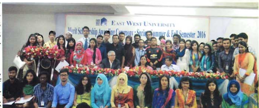
Another Group of Scholarship Recipients with Guests

Treasurer, Deans of different faculties, Chairpersons of different departments, teachers, staff, recipients and their parents also participated in the ceremony.