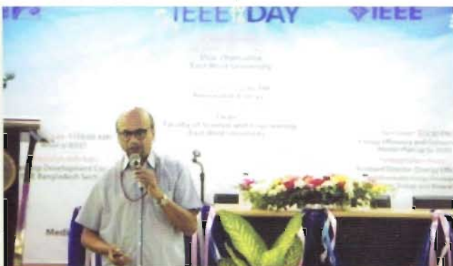
To celebrate the IEEE Day, IEEE EWU student branch