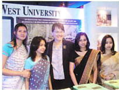
U.S. Trade Show 2007