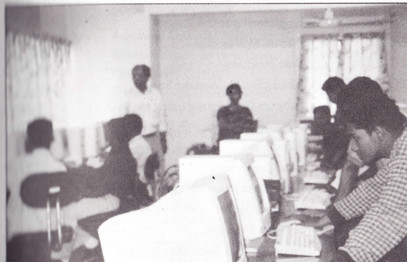
Students working under faculty supervision in the Computer Laboratory

4 Open Electives (9 credits) : Students may take any three courses at 300 or 400 levels to cover the remaining 9 credits.